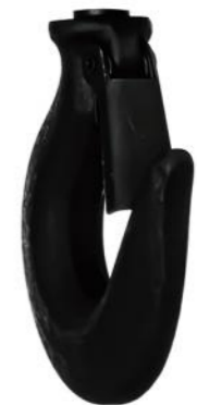
Heavy-duty bottom hooks