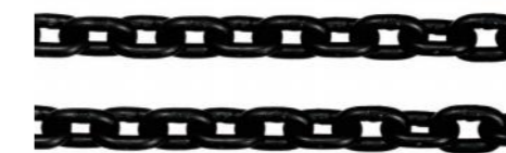
G80 lever chain