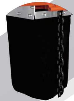
Built-in chain bag