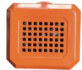
Robust motor & Durable shell