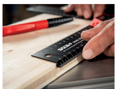
Stop edge for stability and accuracy when measuring and marking angles

The WMD digital angle finder can be used to measure, transfer and draw both internal and external angles.