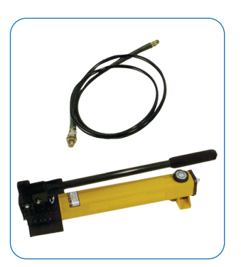
PART NO. D104-KIT