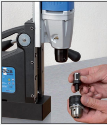
1. Connect adapter to drill chuck.