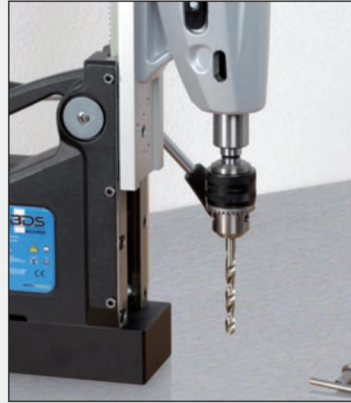
3. Ready for use with twist drill.

For magnetic core drilling machines with Morse taper MK 2 or MK 3.