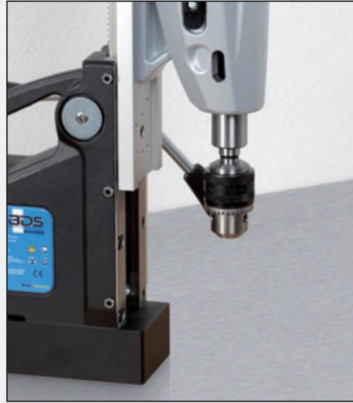
2. Place drill chuck in MT arbor.