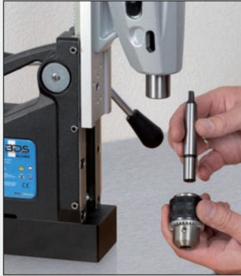
1. Connect taper drift to drill chuck.

ZSI 113 \frac{1}{2} " x 20 NF 1 - 13 mm ZSI 116 \frac{1}{2} " x 20 NF 3 - 16 mm