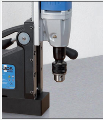
2. Place drill chuck in direct arbor.