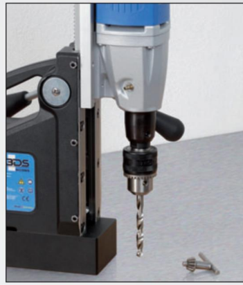
3. Ready for use with twist drill.

For magnetic core drilling machines with direct arbor 19 mm Weldon ( \frac{3}{4} "")